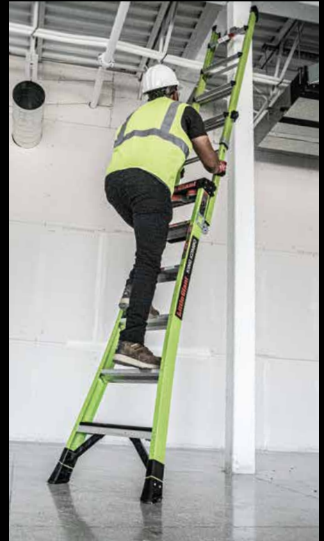
V-Bar on Outside Corner