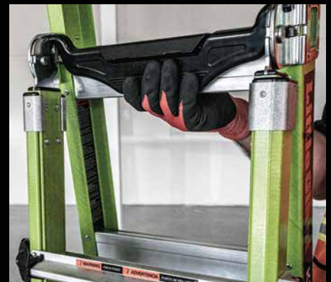
One-Handed Grip-N-Go Hinge