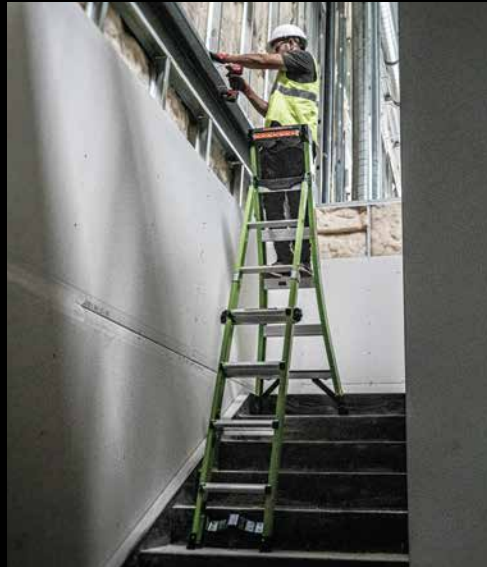
Extended Rear Section for Work on Stairs