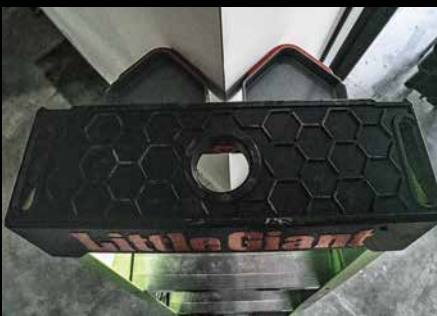
Outside Corner Rotating Wall Pad