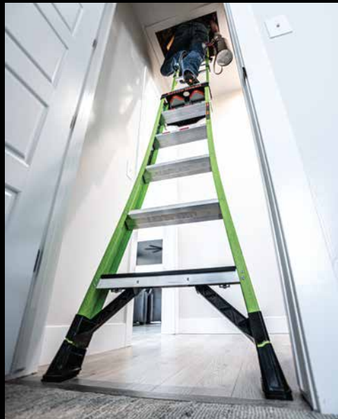
Narrow Access Points