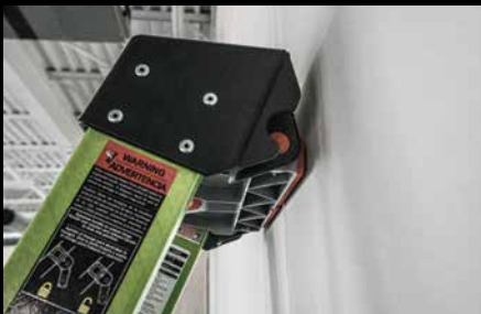
Flat Wall Rotating Wall Pad