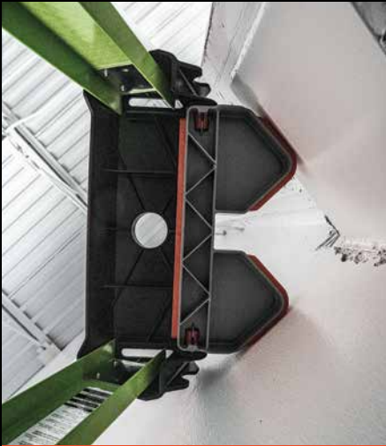
Inside Corner Rotating Wall Pad